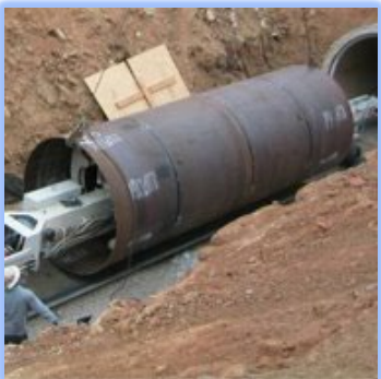
Pipeline Relining $493 million