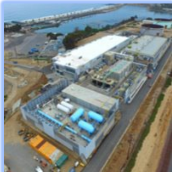
Carlsbad Seawater Desalination $1 billion