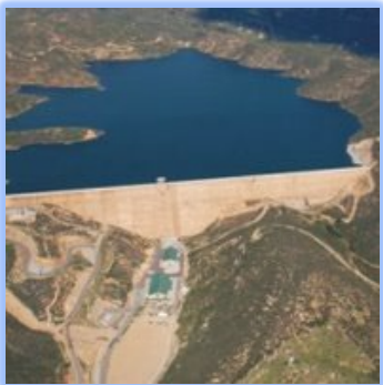
Local Surface Water Storage $1 billion