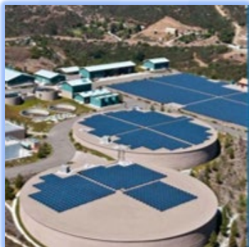
Twin Oaks Valley Water Treatment Plant $179 million