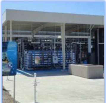
Potable Water Reuse & Purple Pipe Hundreds of Millions $