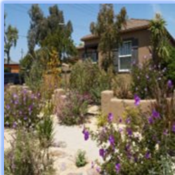
Water Use-Efficiency Investments Hundreds of Millions $