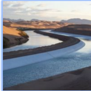
QSA Water Transfer & Canal Linings Hundreds of Millions $