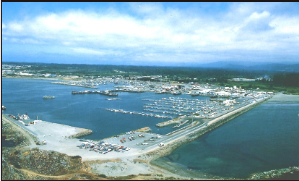
1978 Salmon season open - Over 500 recreational boats are moored