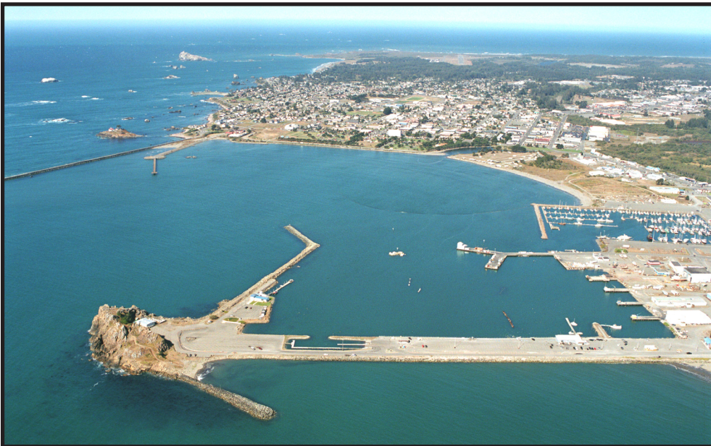
Salmon season closed - only 60 floats are installed for the summer recreational traffic